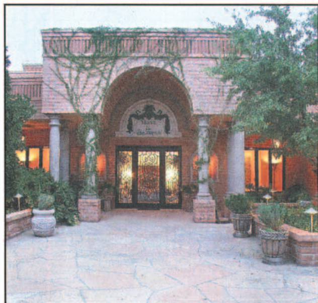
The entrance to the European-style villa resembles that of a luxurious hotel. Antique iron gates came from the old Pioneer Hotel.